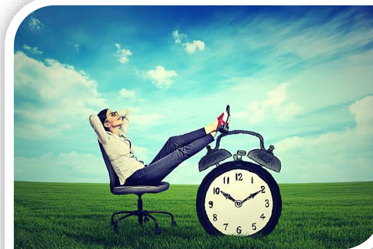
Freedom Of Time